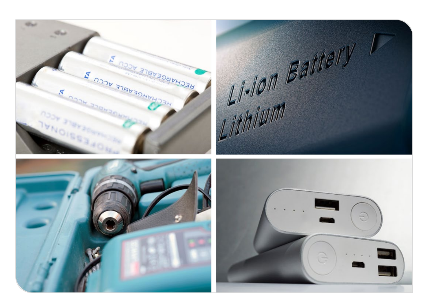
Version 5.3 Background to ecolabelling 15 June 2018 – 28 February 2026